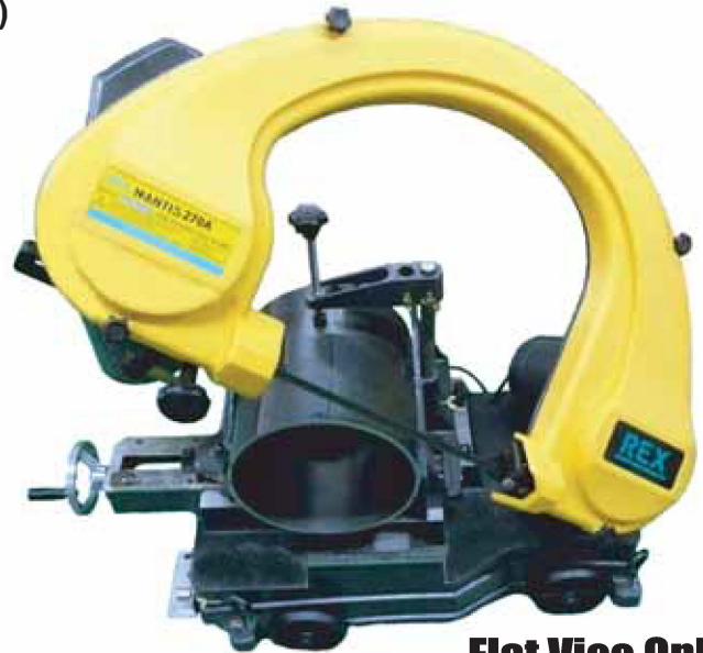
Flat Vice Only